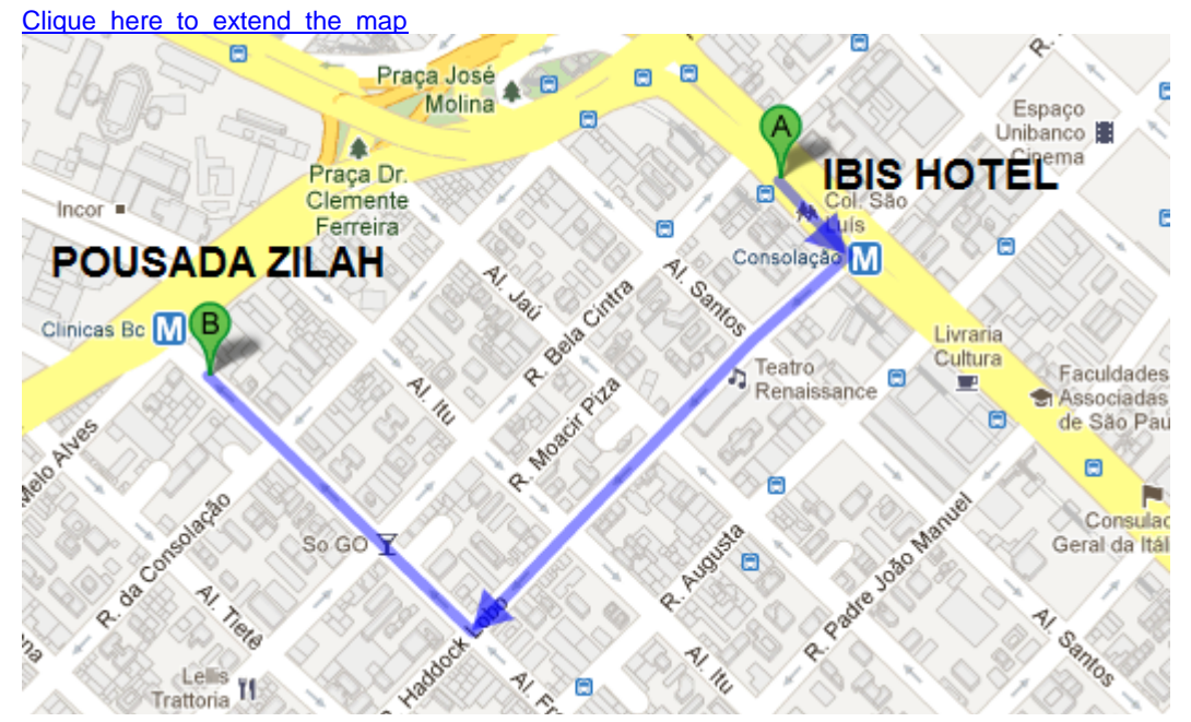
If you take a taxi from Hotel IBIS to Pousada Zilah it will cost around R$10,00 (5.00 USD)

Once you are at IBIS Hotel, follow the map below (it is 15 minutes walk to Pousada Zilah):