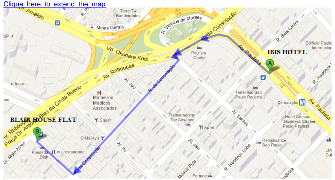
If you take a taxi from Hotel IBIS to Pousada Zilah it will cost around R$10,00 (5.00 USD)

Once you are at IBIS Hotel, follow the map below (it is 15 minutes walk to Blair House Flat):