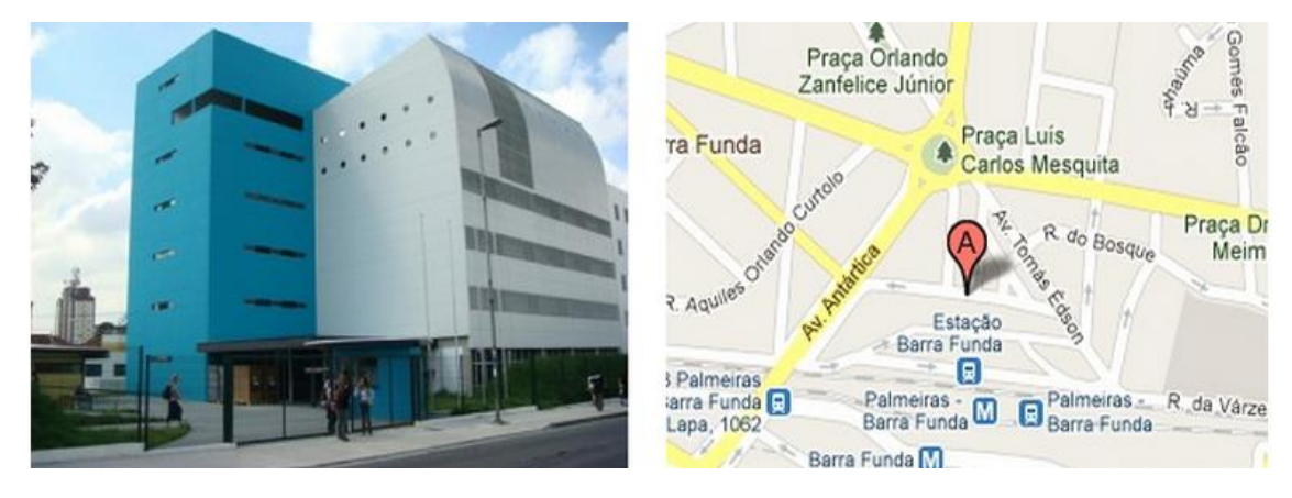
Institute address: Rua Dr. Bento Teobaldo Ferraz, 271 – Bloco 2 Barra Funda – São Paulo.

Follow the signs to the exit which is called Av. Marques de Sao Vicente. After passing through the turnstiles, turn left and walk until the end of the station. At the end of the station, go down the stairs and you will see immediately a large white and blue building across the street in front of you. The white and blue building is the Instituto de Artes, and next to it is a large white and green building which is the Instituto de Fisica Teorica. Enter in the gate between the two buildings and from the green building go to the 4<sup>th</sup> floor.