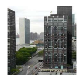
New York (2007)