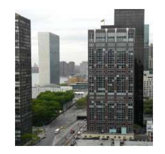
New York (2007)