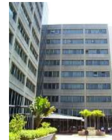
Sao Paulo (2011)