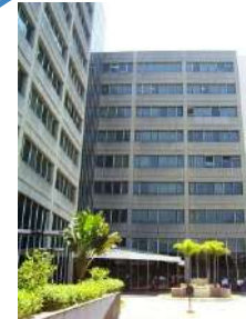
Sao Paulo (2011)