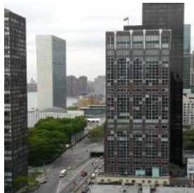
New York (2007)