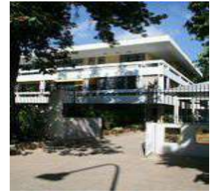
New Dehli (2006)