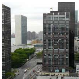
New York (2007)