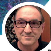
ROBERTO KRAENKEL IFT-UNESP, Brazil

This seven-day school will address modeling of infectious disease dynamics with the objective of improving public health policies. The program includes a course on deterministic epidemic models and a course on the numerical treatment of those models. An important feature is the focus on group work involving “hands-on” modeling challenges. There will be classes in the morning and group projects in the afternoon. Participants from all areas related to the subject are welcome to apply. Knowledge of basic differential calculus is required.